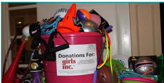
EVENT ATTENDEES GENEROUSLY DONATED SPORTING EQUIPMENT TO SUPPORT GIRLS, INC.'S "SPORTING CHANCE" PROGRAM